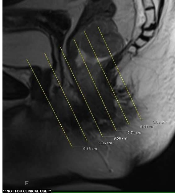
oblique coronal angulation (parallel to the long axis of the anal canal in the sagittal plane)