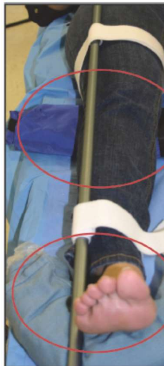
Metal Rod Placement